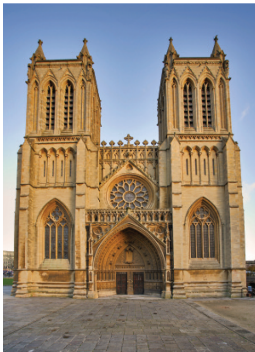
The beautiful ornate front of Bristol Cathedral, on College Green.