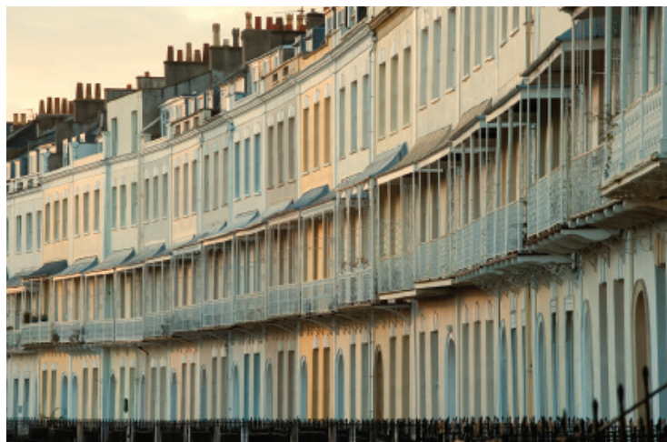
The grand Georgian houses of Royal York Crescent, Clifton