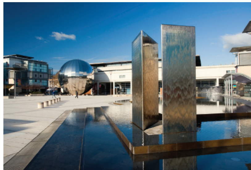
Metal sculptures and water everywhere on a clear day at Millennium Square.